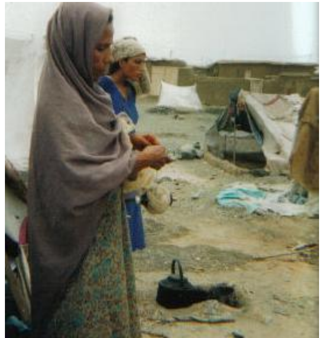
Life in Jalozai Refugee Camp – Peshawar – 2000