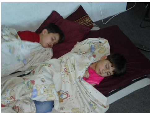
Safe and Sound

The children of Khorasan are now assured of a safe and loving environment in which they can thrive. Take a look at the picture below of some children in Kabul during the Taliban regime.