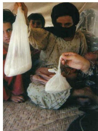
Food for a week for a family of 8 – Jalozai Refugee Camp